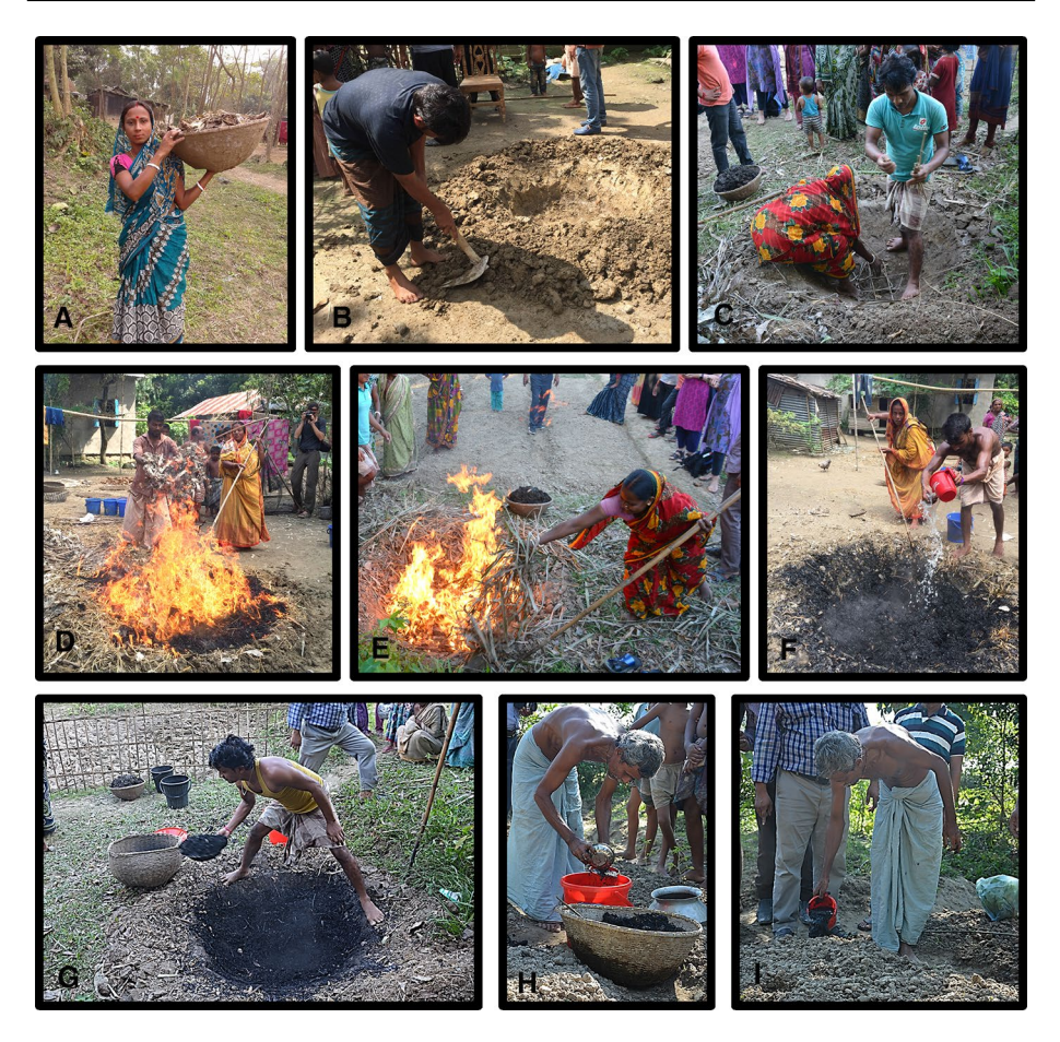
Fig. 2 Steps to produce and use cow-urine-enriched biochar fertilizer. (A detailed manual is available from the corresponding author upon request.) These steps can be completed in one day and the fertilizer can be used immediately: A Collect biomass feedstock, such as dry leaves and rice straw, from one's home or nearby sites. B Dig a shallow kiln hole in the soil. C Arrange a well aerated feedstock pile at the bottom of the kiln. D Start a fire at the top of the feedstock pile. E Once the fire is hot, having carbonized the lower parts of the feedstock pile, slowly add feedstock layer by layer to be carbonized by the heat of the fire curtain formed above the feedstock. F Douse the carbonized feedstock with water to stop the fire and carbonization. G Collect the biochar. H Mix the resulting biochar with cow urine to create urine-enriched biochar fertilizer (using a 1:1 ratio). I Apply urine-biochar fertilizer to the root zone of new plants

be challenging for families who did not have their own cows. Respondents reported that they did not need to spend money to obtain cow urine, but collected it either from their own cow or from their neighbors' cow free of cost, using the drainage system in the cow shed. In these cases, husbands or other male family members usually took the responsibility of collecting cow urine from neighbors and relatives because women were not permitted to visit other homes without a male relative. In some instances, mothers-inlaw performed this task with the help of male family members.